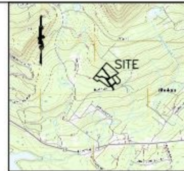
LOCATION MAP SCALE 1" = 200'